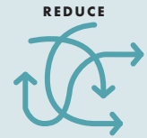
REDUCE RISK OF LOSS