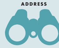
ADDRESS LACK OF VISIBILITY